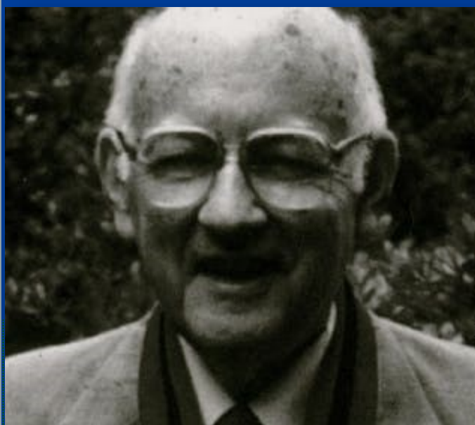
Father of Modern Creativity: Dr Ellis Paul Torrance—8 October 1915-12 July 2003

The E. Paul Torrance International Roundtable on Creative Thinking aims to refresh the work and legacy of Dr Torrance internationally especially among today's crop of creativity enthusiasts and scholars, push the boundary of knowledge on creative thinking and giftedness as well as increase knowledge sharing within creativity field.